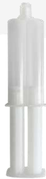
GLUEMIX MIXING NOZZLE M01