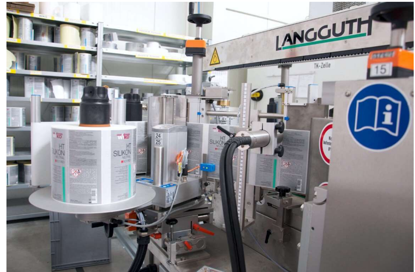
AUTOMATED AND MANUAL LABELLING