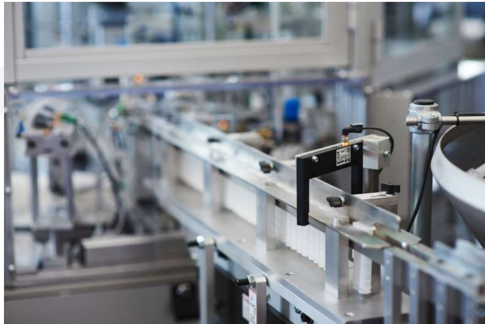
2K AUTOMATIC FILLER – 1C AUTOMATIC FILLER – 2C HALF-AUTOMATIC FILLER